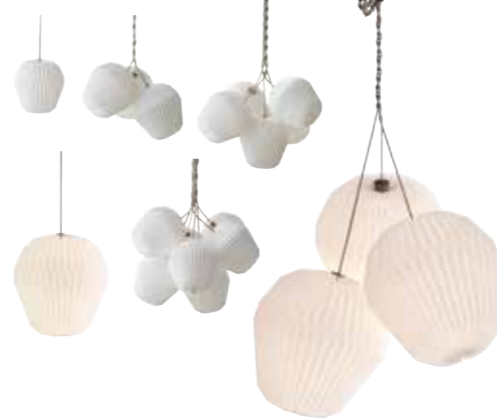
THE BOUQUET Design: Sinja Svarrer Damkjær