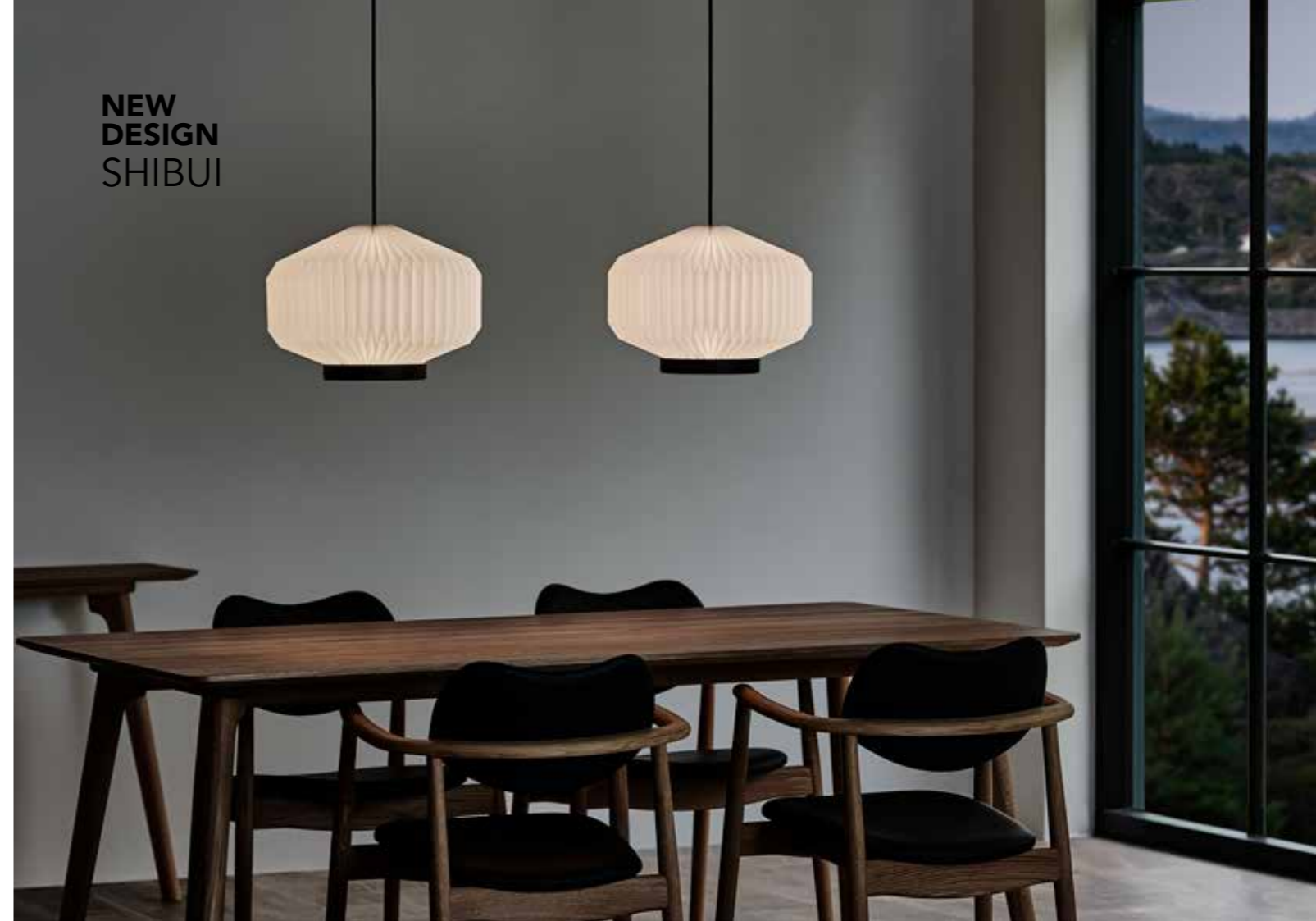
NEW DESIGN SHIBUI