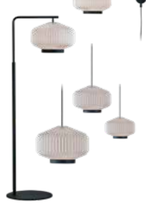
SHIBUI Design: Søren Refsgaard