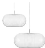
DONUT Design: Lise Navne