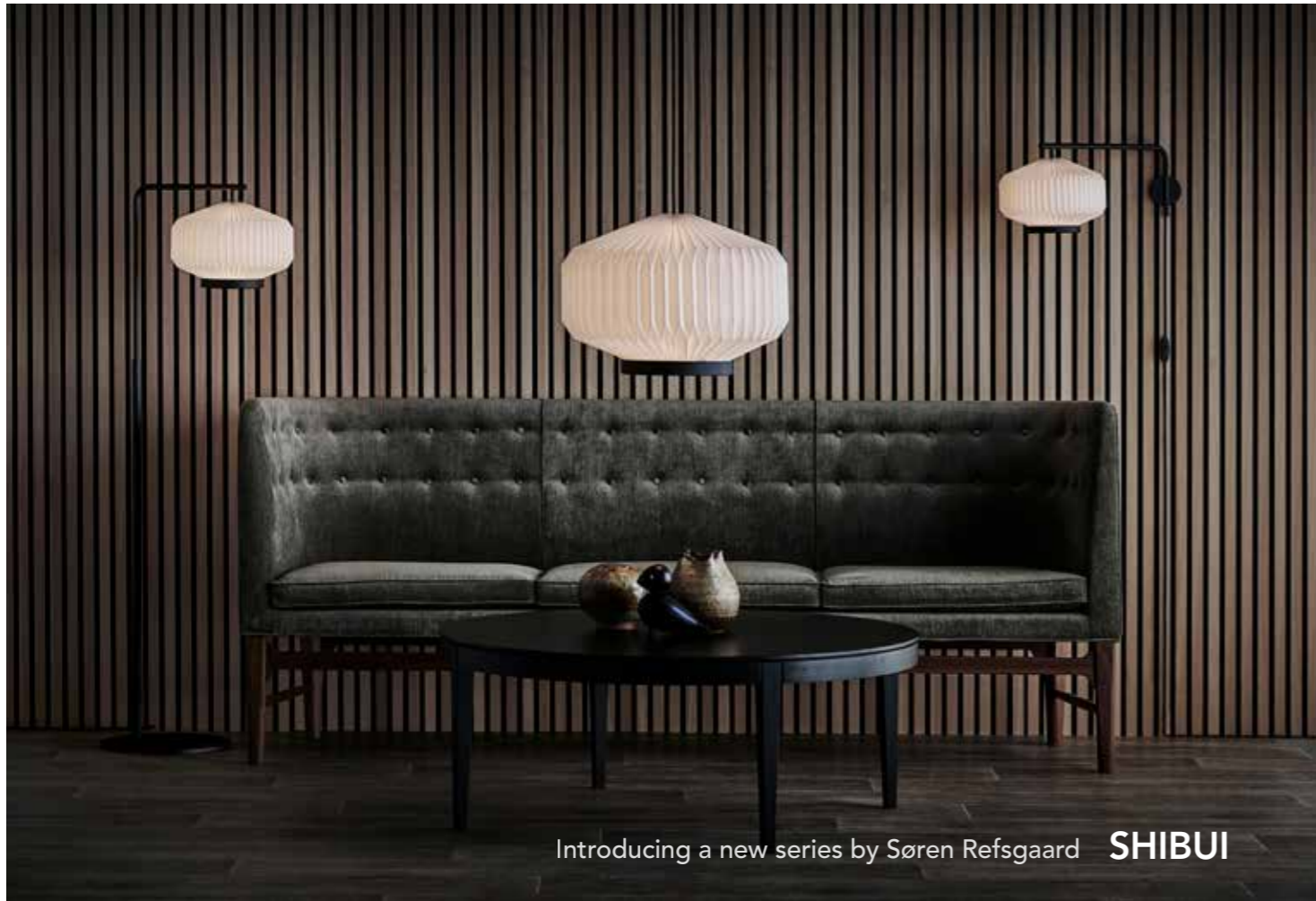
Introducing a new series by Søren Refsgaard SHIBUI