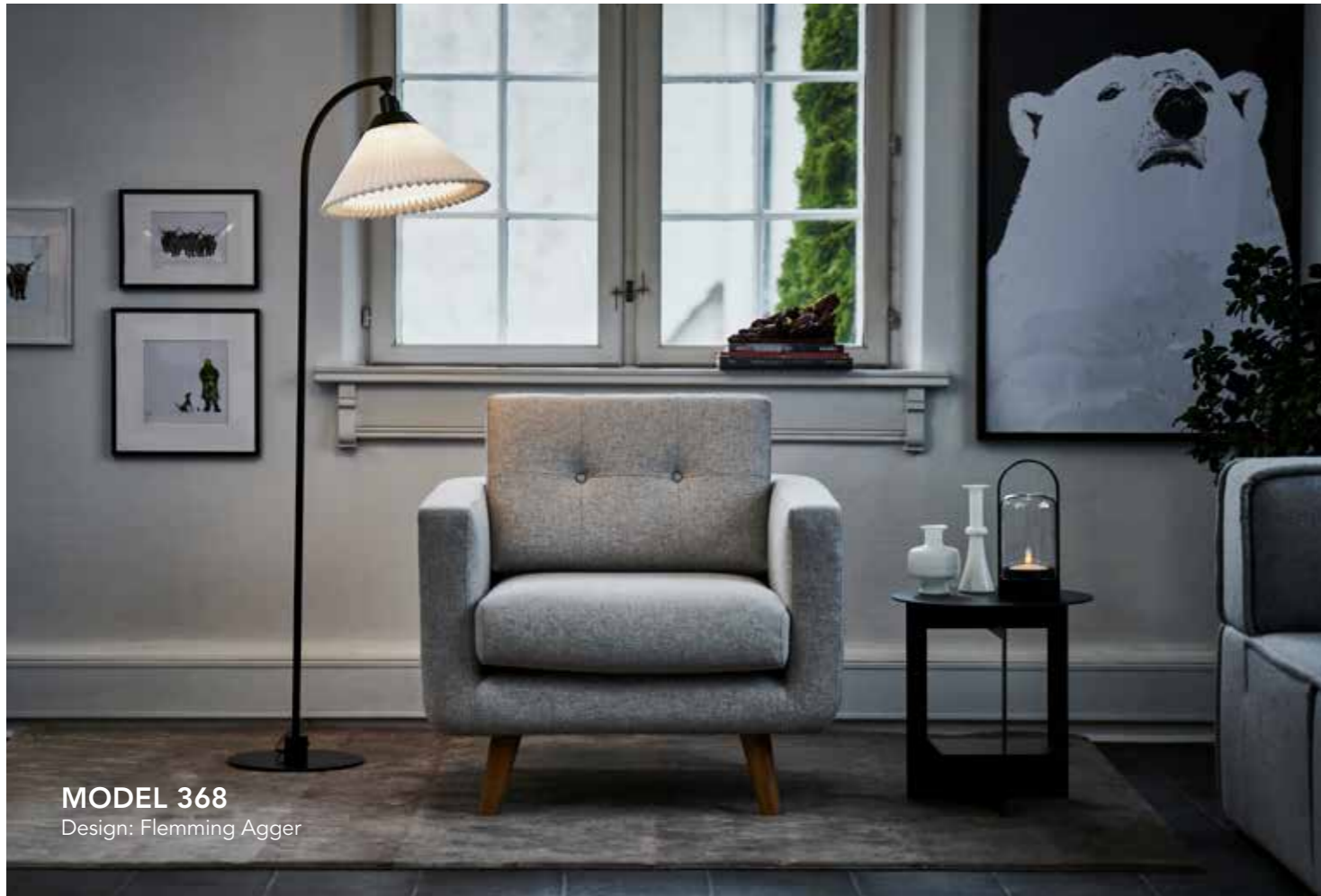
MODEL 368 Design: Flemming Agger