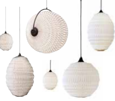
CALEO Design: Rikke Frost