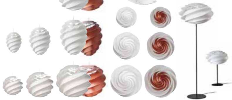
SWIRL Design: Øivind Slatto