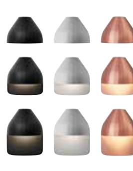
FACET IN & OUTDOOR Design: Aurélien Barbry